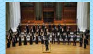
合唱团: 歌弦合唱团 Choir: Vocal Consort

票价 (未加 SISTIC 收费) Ticket Prices (exclude SISTIC fee) $70, $60, $45/$30*, $30/$20*